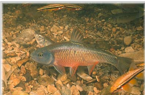
common shiner