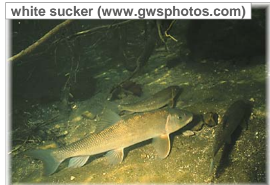
white sucker