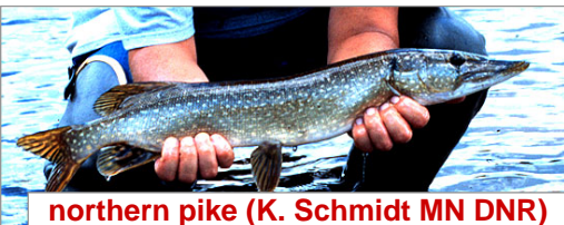
northern pike