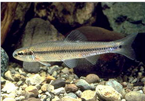
bluntnose minnow