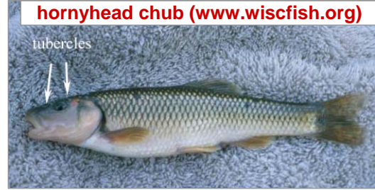
hornyhead chub