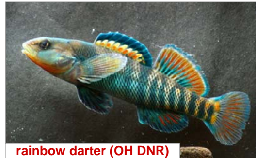
rainbow darter