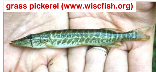
grass pickerel