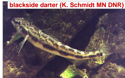
blackside darter