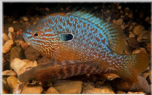
longear sunfish

Photos of some fish species characteristic of Michigan's Warm Small Rivers . Warm fishes are red font ; thermally transitional fishes are gray font .