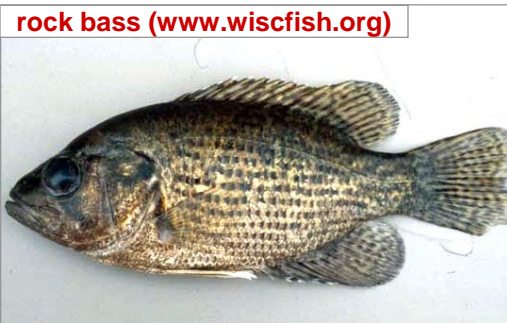
rock bass